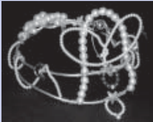
Year 8 Wire Tiara