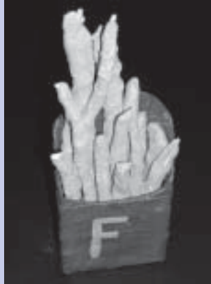
Year 8 Pop Art