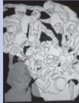
Dylan Hammond Yr.12